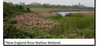
*New England Rose Mallow Wetland